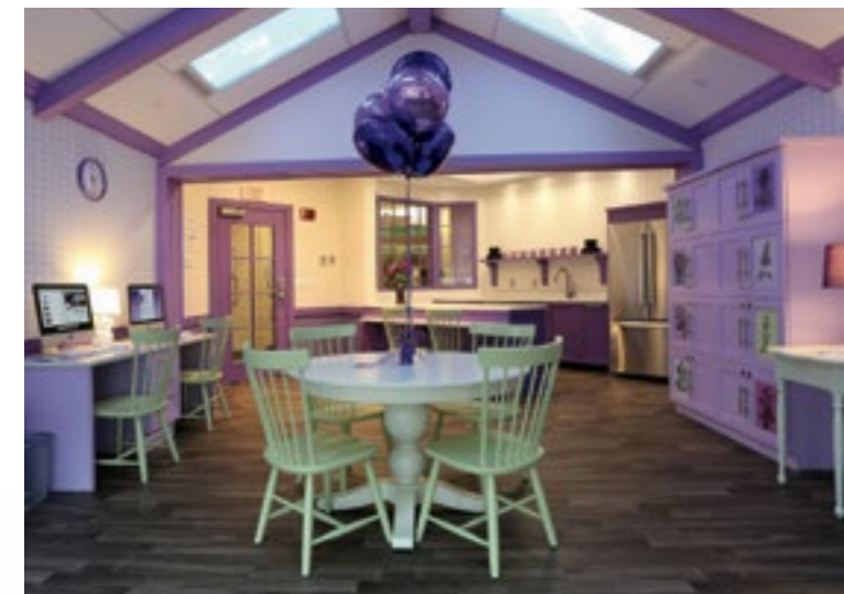
The Izzy Family Room

The Izzy Family Room is located on the 5th floor. This is a family space for both parents/caregivers and patients. The Izzy Foundation offers snacks, coffee, hygiene products and meals on most days. There is a kitchen, microwave, computers, television, and comfortable seating. For your convenience, the space is open 24 hours a day. Please ask the unit secretary for the access code