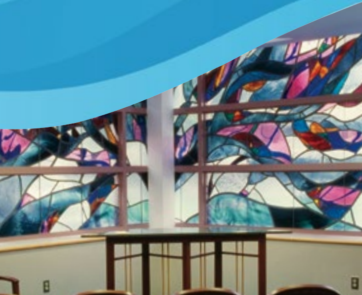
Hasbro Children's Chapel