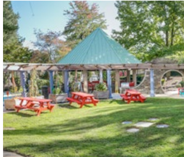
Balise Healing Garden

The house offers a stress-free place for families to step away from the hospital, have a meal and share a unique support system with other families, staff and caring volunteers. There is no charge to stay at the Ronald McDonald House. For more information, please speak to your social worker at the hospital, or call the Ronald McDonald House of Providence directly at 401-274-4447.